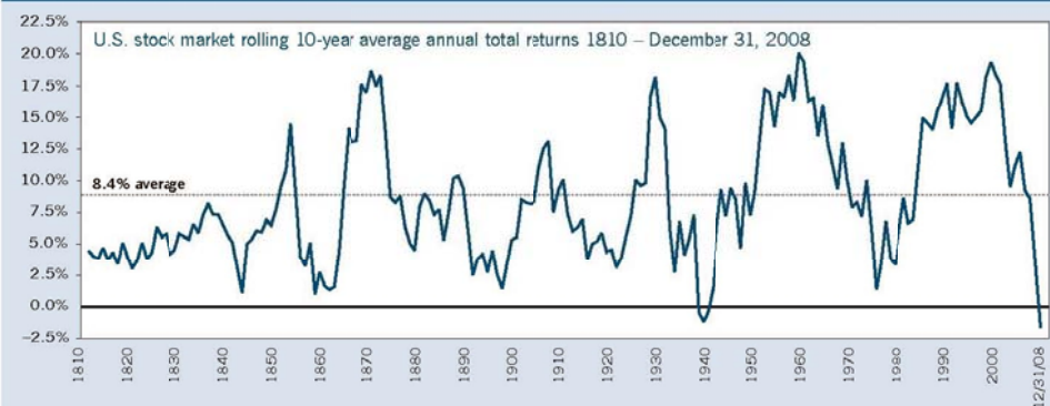
Ten-year returns have hit historic lows

A recent American Funds study showed that in any 10-year period when the market averaged less than 2.5% for 10 years running, it then returned an average of 13.3% for the next 10 years.